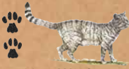
African Wild Cat