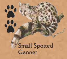
Small Spotted Genet