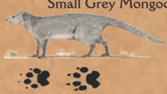
Small Grey Mongoose