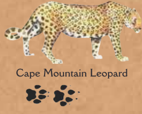
Cape Mountain Leopard